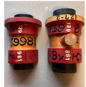
Bethlehem Steel wooden patterns